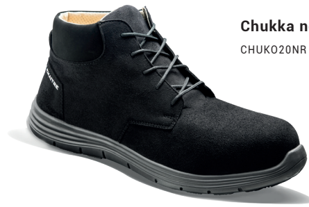
Chukka noir O2 SRC CHUKO20NR